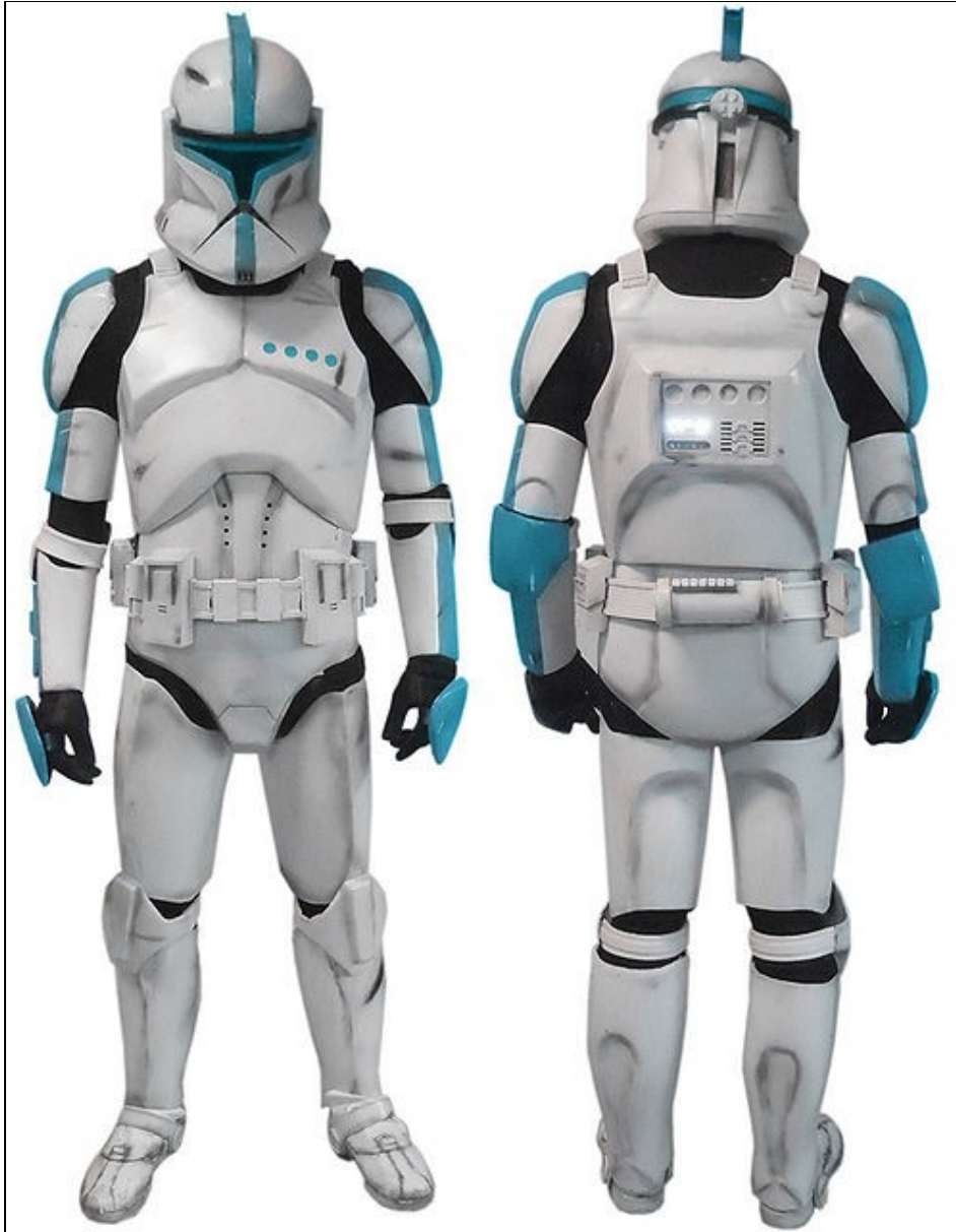
Model Clone Trooper Lieutenant