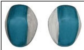
Shoulder Armor For 501st approval: