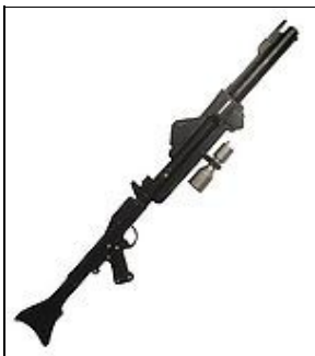
DC-15A Blaster Rifle For 501st approval:

Manufactured by BlasTech Industries, the DC-15A is a tibanna gas, cartridge powered weapon. Hyper-ionized blue plasma bolts are more than capable of penetrating armored units. Exceptionally effective against both droids and contemporary targets.