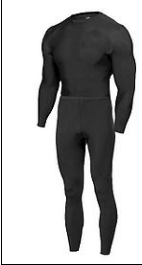
Under Suit For 501st approval: