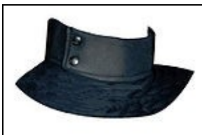
Neck Seal For 501st approval: