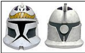
Squawk Helmet For 501st approval:

The following costume components are present and appear as described below.