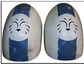
Shoulder Armor For 501st approval: