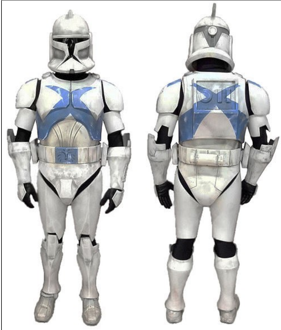
Model TC 4728