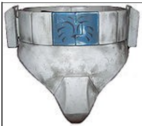
Codpiece and belt front For 501st approval: