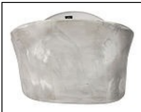
Kidney Armor For 501st approval: