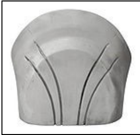
Abdomen Armor For 501st approval: