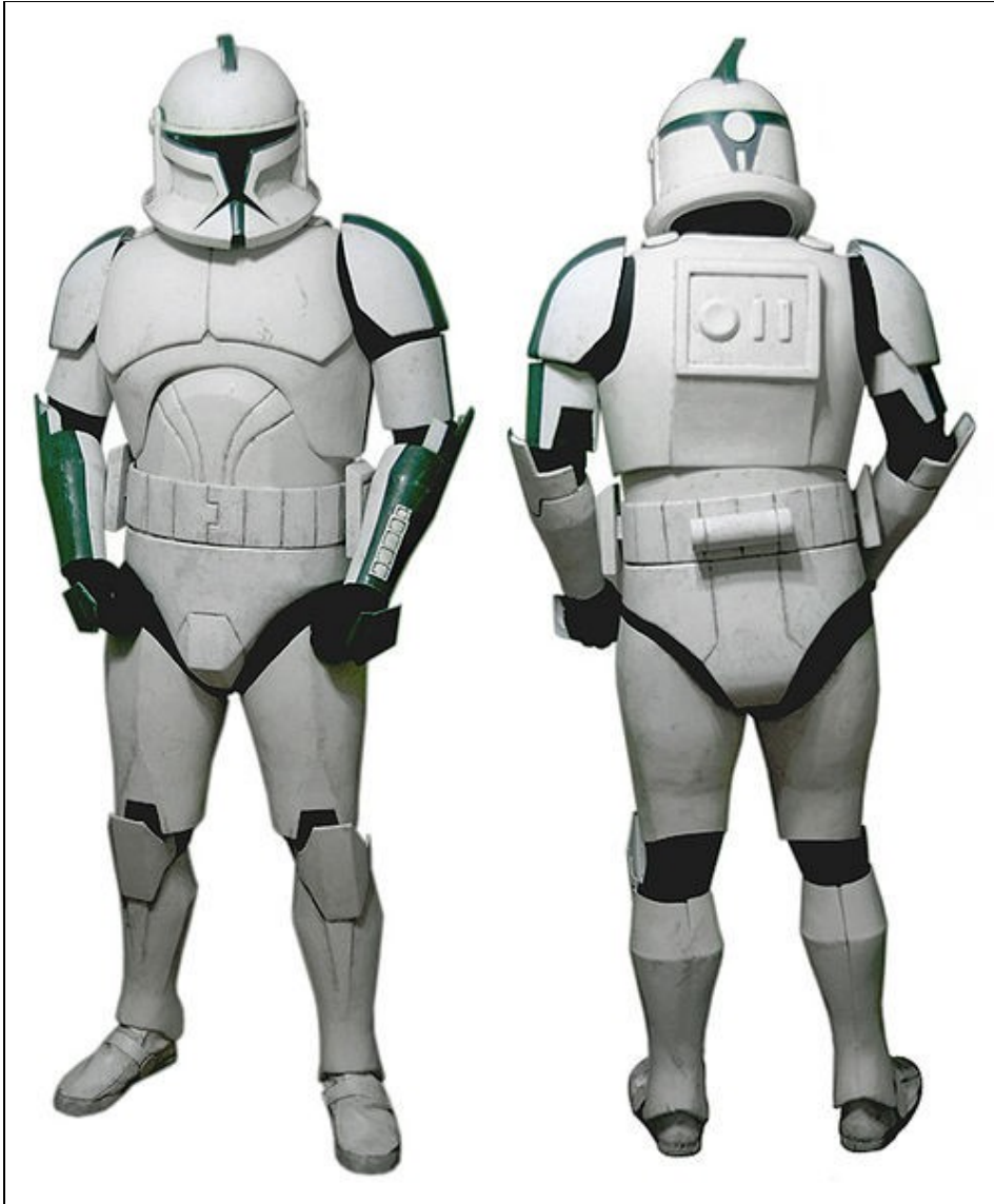
Model TC 7602