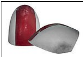
Shoulder Armor For 501st approval: