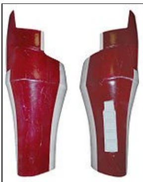
Forearm Armor For 501st approval: