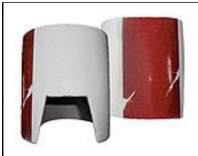
Upper Arm Armor For 501st approval: