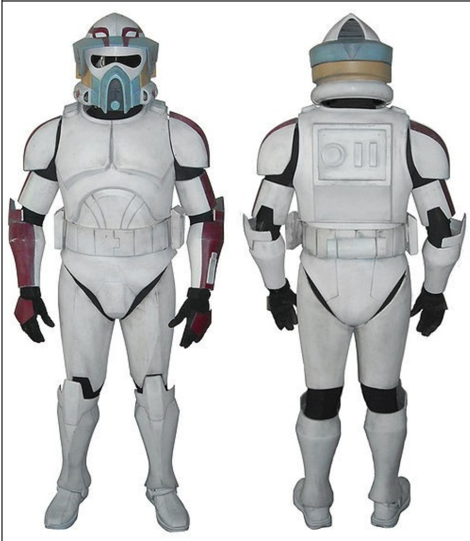
Model CX 9509