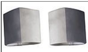
Upper Arm Armor For 501st approval: