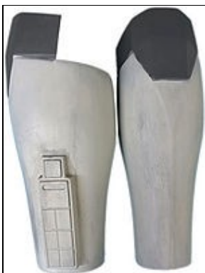
Forearm Armor For 501st approval: