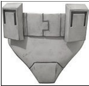
Codpiece For 501st approval: