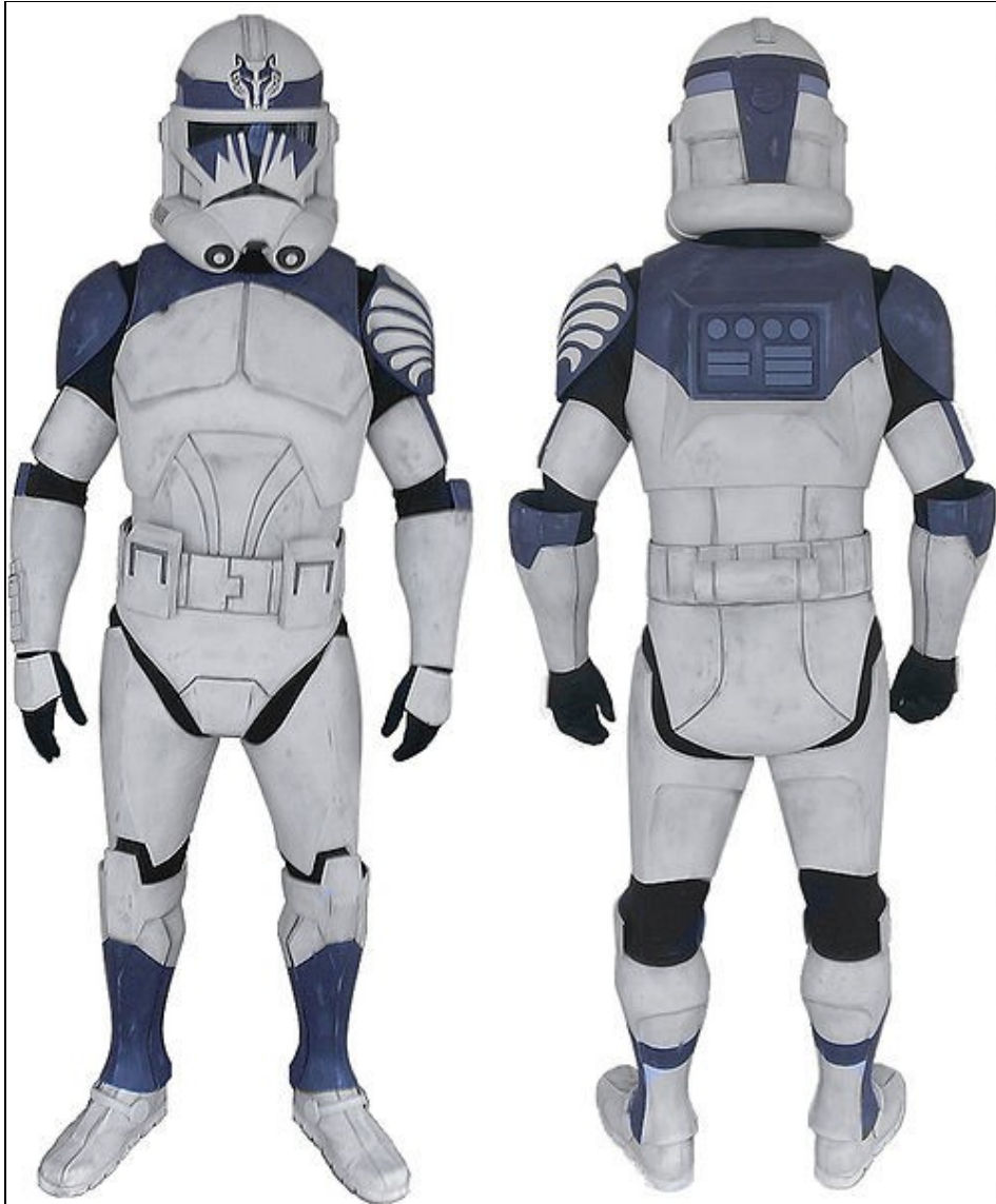
Model CT 49876 , Photo by Belle C.