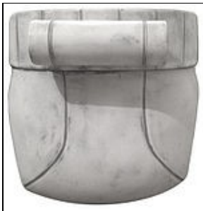
Posterior Armor, belt rear and Detonator For 501st approval: