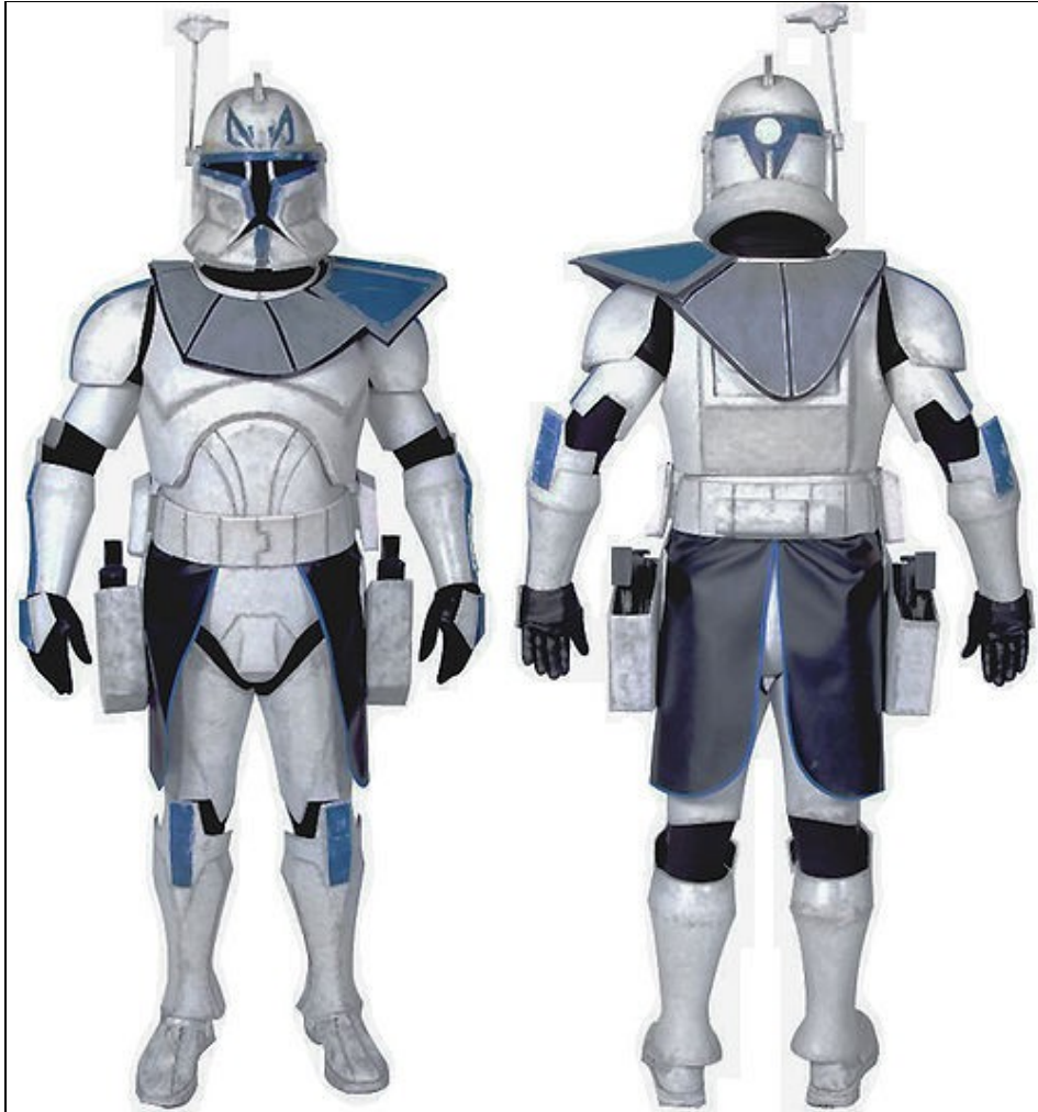
Model CC 3714