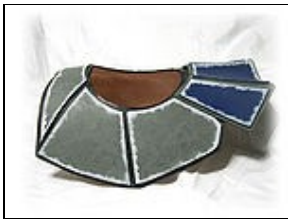
Pauldron For 501st approval: