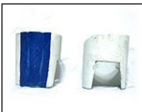
Upper Arm Armor For 501st approval: