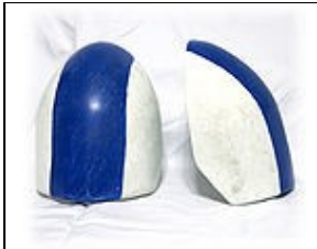
Shoulder Armor For 501st approval: