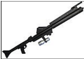
DC-15A Blaster Rifle (animated style) For 501st approval:

Manufactured by BlasTech Industries, this blaster is the standard issue weapon carried by the Clone Troopers of the Grand Army of the Republic.