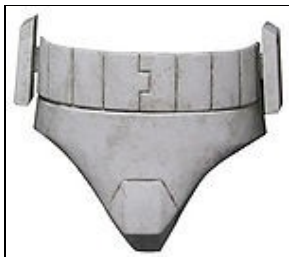
Codpiece and Belt front For 501st approval: