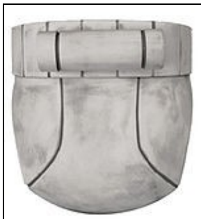
Posterior Armor, belt rear and Detonator For 501st approval: