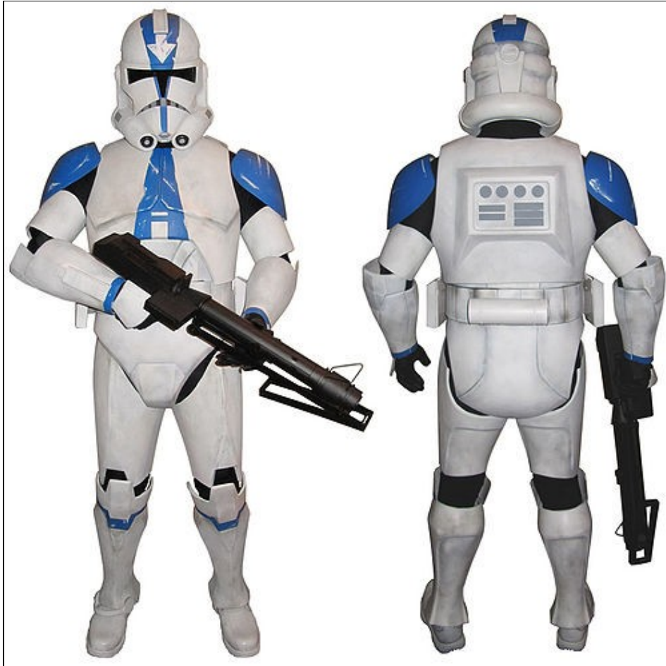
Model CC 2065