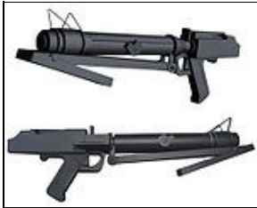
DC-15S Blaster Carbine (animated style) For 501st approval:

Items below are optional costume accessories. These items are not required for approval, but if present appear as described below.