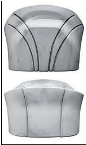
Abdomen Armor For 501st approval: