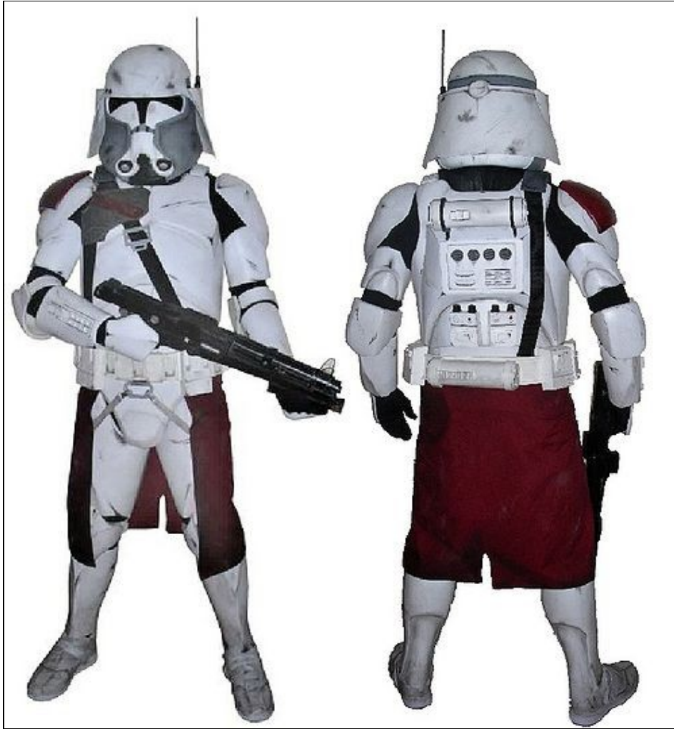
Model CC4841