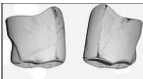
Upper Arm Armor For 501st approval: